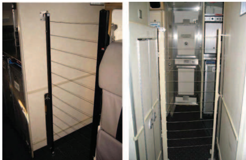
Fig. 2. Fully deployed installed physical secondary barrier. (52)

with a 3% discount rate, this equates to a present value cost of $13.5 million per year.